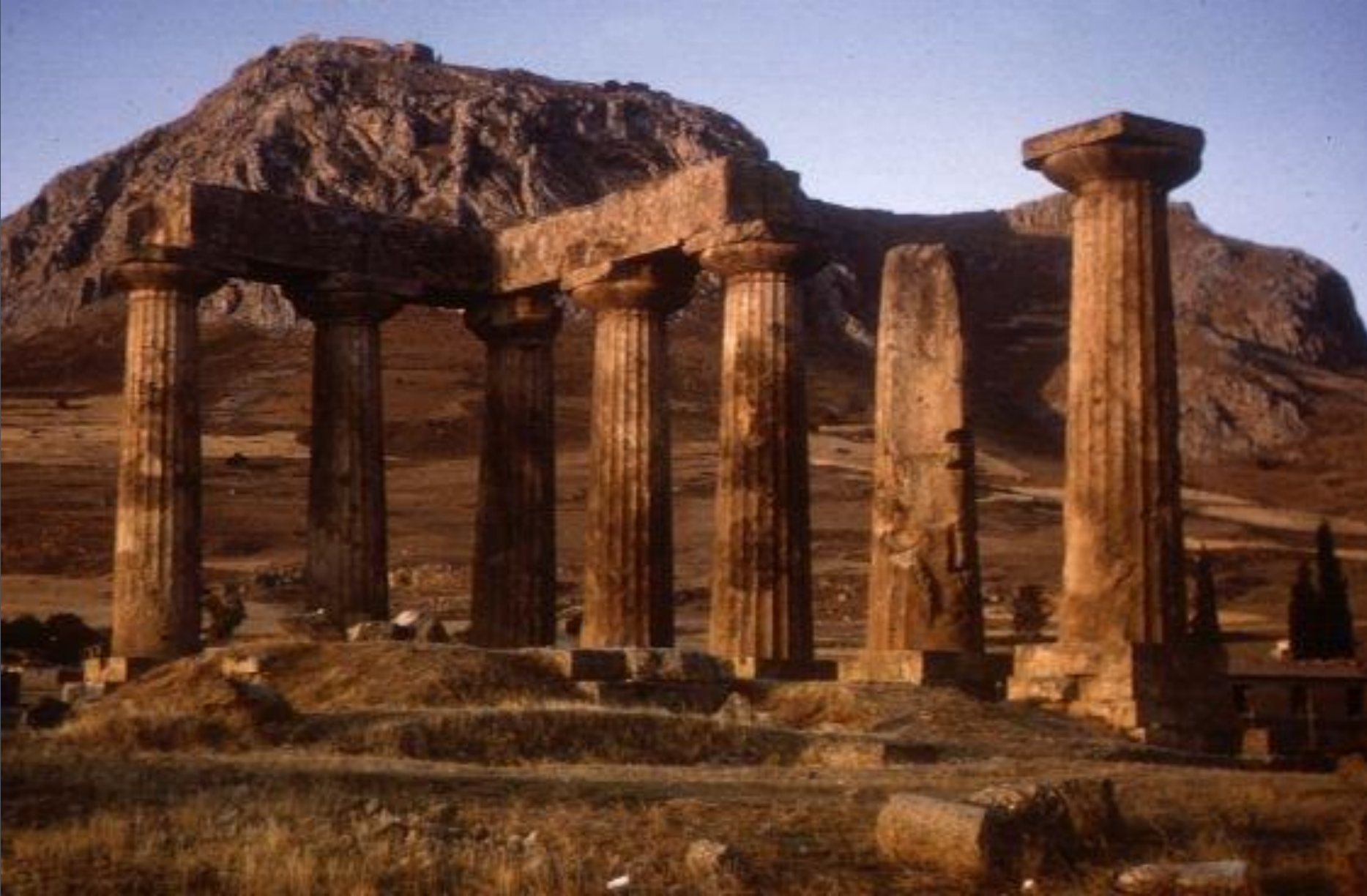
Temple of Apollo with Acrocorinth in Background, Viewed from the North East

Crane, Gregory R. (ed.) The Perseus Project, http://www.perseus.tufts.edu , September, 1999.